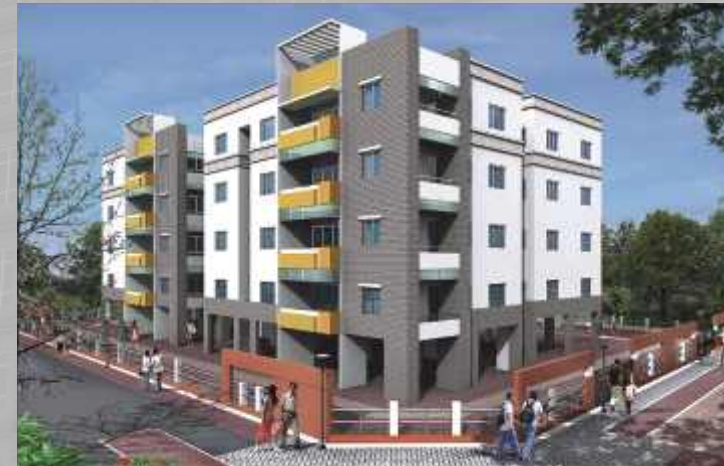
MID RISE APARTMENTS: Well-appointed apartments starting from 600 to 2500 sq. ft, 1 to 5 BHK, with lifts and covered car parks.