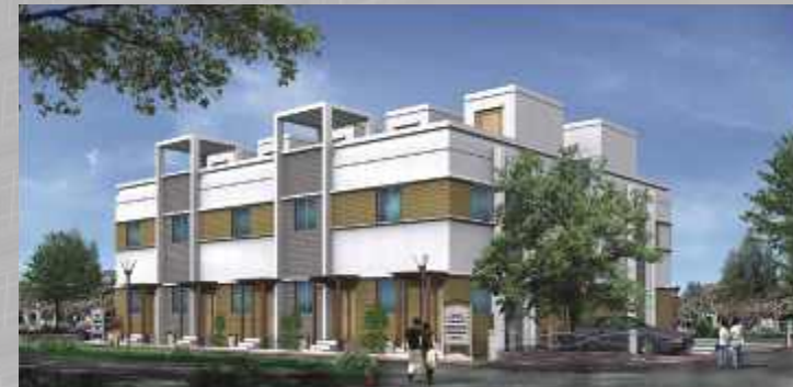
ROW HOUSES: Independent, lavishly-styled homes starting from 650 to 1500 sq. ft, with 1 & 2 BHK and car park.